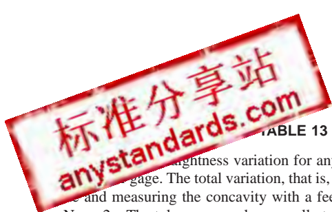
TABLE 13 Straightness Tolerances for Seamless Round Mechanical Tubing

...straightness variation for any 3 ft (0.9 m) of length is determined by measuring the concavity between the tube and a 3-ft straightedge gage. The total variation, that is, the maximum curvature at any point in the total length of tube, is determined by rolling the tube on a surface and measuring the concavity with a feeler gage.