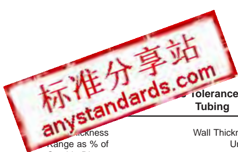
Tolerances for Round Cold-Worked Tubing