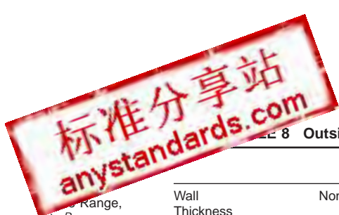
Table 8 Outside and Inside Diameter Tolerances for Round Cold-Worked Tubing A,B,C

Thermal Treatment after Final Cold Work Producing Size